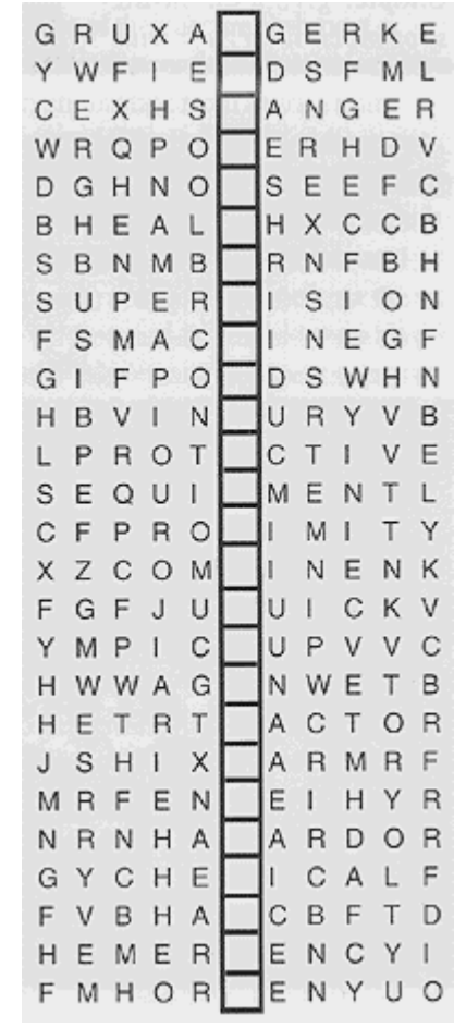
Go to the website for the answers!!!!

Insert a different letter into each of the 26 empty boxes to form a farm-related word of four or more letters reading across. The letter you insert may be the first, last, or in the middle of the word. Each letter of the alphabet will be used only once. Cross off the list below as you use it. Example: In the first row across, insert the letter U and form the word AUGER.